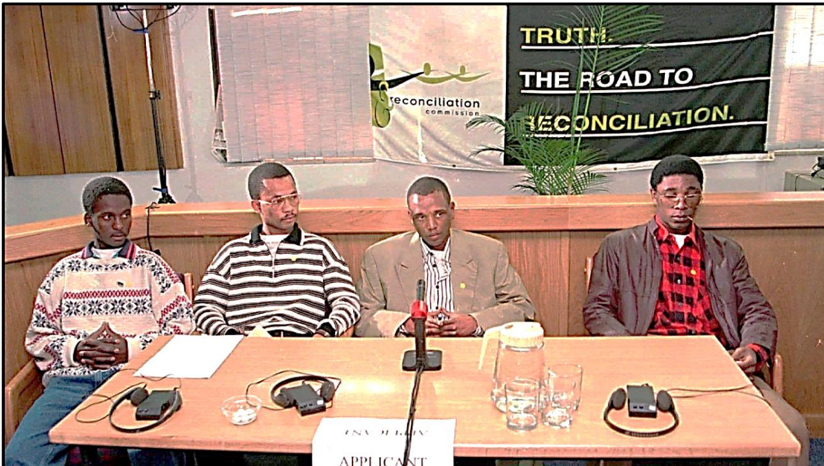
[Ho tswa ho images amy biehl newspaper. jfif-photos. Accessed on 1 September 2019.]

Setshwantsho sena se bontsha babolai ba Amy Biehl nyeweng ya amnesty ka la 8 July 1997, Motse Kapa.