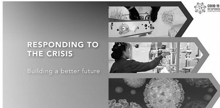
Figure 1: https://www.unido.org/news/covid-19-responding-crisis-building-better-future

As the COVID-19 virus spread from late 2019 into 2021, governments limited large gatherings and advised people to practise social distancing. Restrictions caused by efforts to limit the spread of the virus changed practically every part of life and the way things used to be.