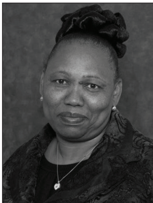
Matsie Angelina Motshekga, MP Minister of Basic Education

MRS AM MOTSHEKGA, MP MINISTER DATE: 14 NOVEMBER 2019