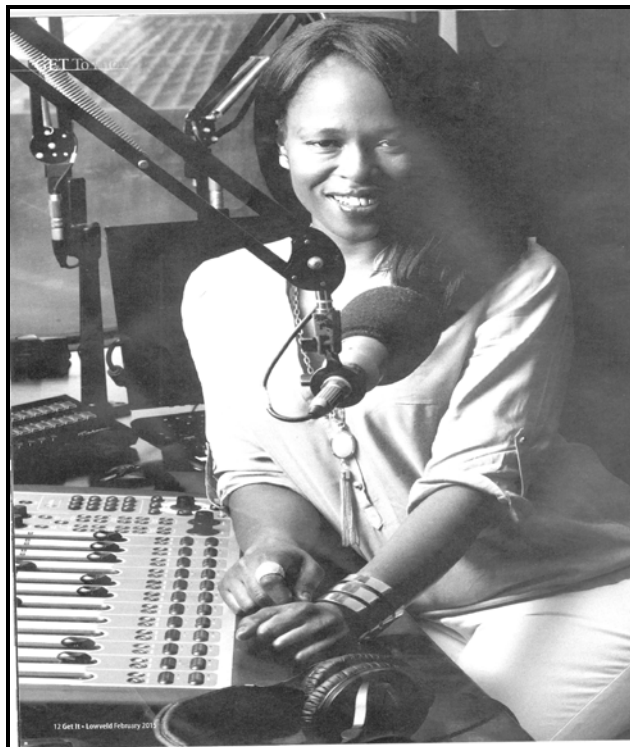
[Umtfombo: Get It , 2015]