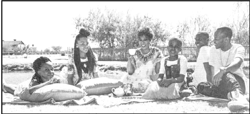
[Itsetfwe ku Drum , June 2016, Likhasi 83]