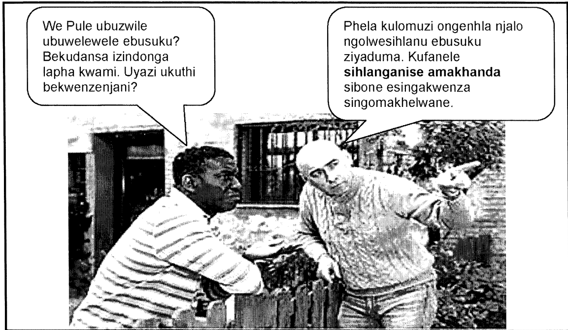
[Sicashunwe ku- googlepics , sahlelwa]

5.2.1 Lungisa amaphutha emshweni olandelayo: