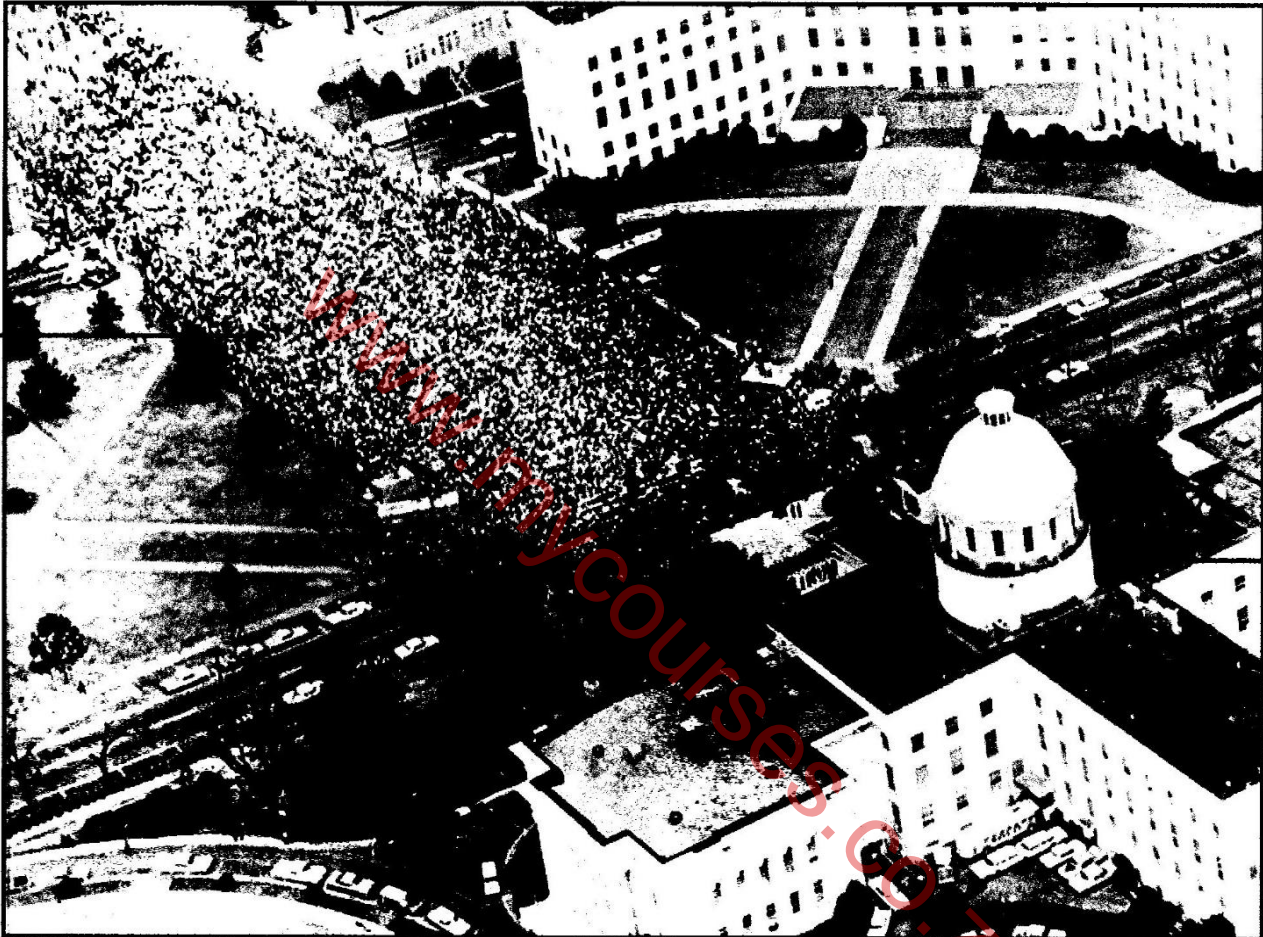
[From The Civil Rights Movement: A Photographic History by S Kasher]

This is an aerial photograph taken at Dexter Avenue in front of the Alabama state capitol in Montgomery on 25 March 1965. It shows some 25 000 marchers who managed to arrive at Montgomery on their third attempt after leaving Selma on 21 March 1965.