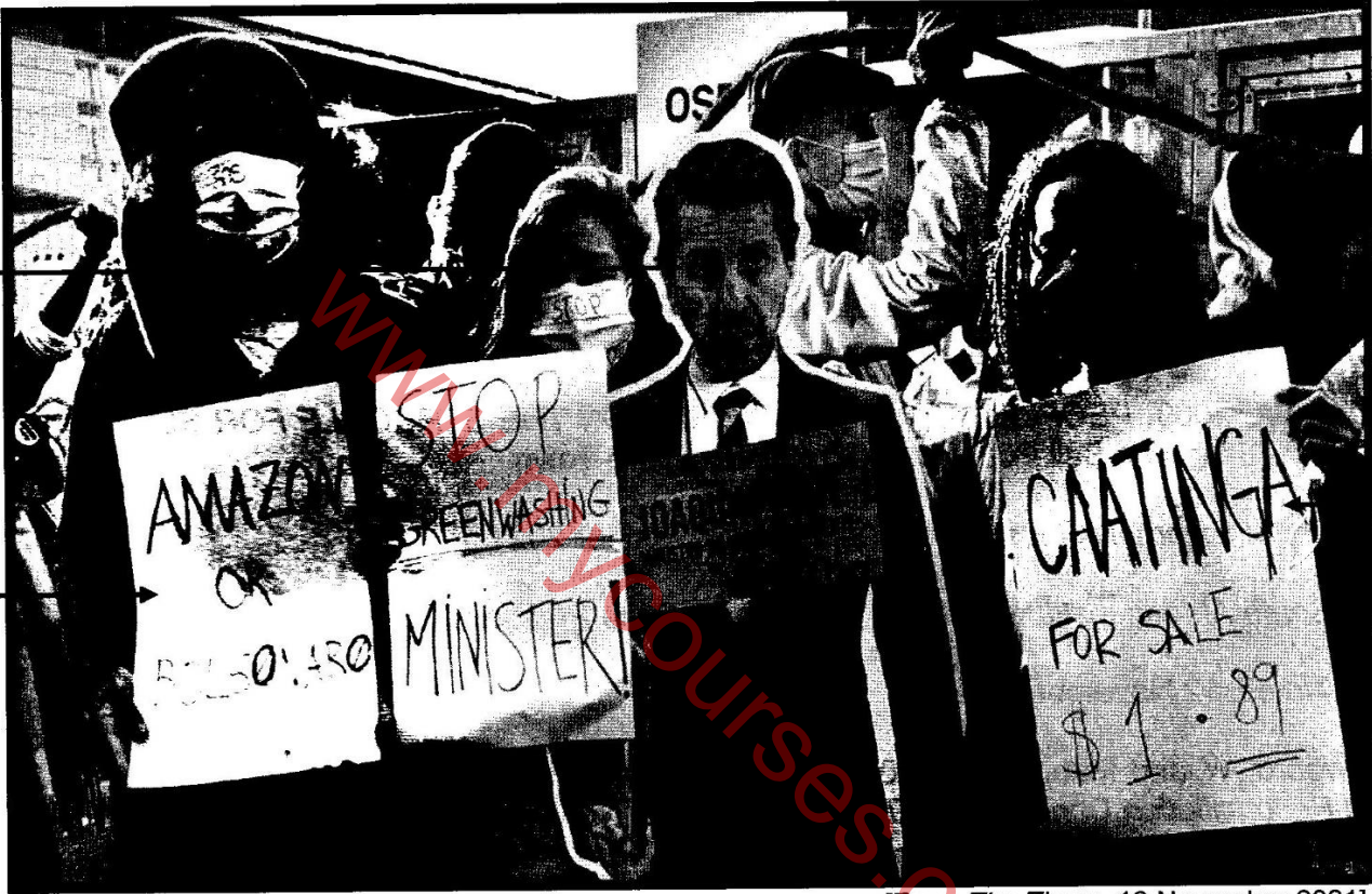
[From The Times , 12 November 2021]

This photograph by C Kampfner for The Times newspaper was taken outside the COP26 Summit held at Glasgow, Scotland, on 12 November 2021. It portrays a protest by Brazilians against their political leaders (Joaquim Leite, Minister of Environment, and Bolsonaro, Brazilian President) for not doing enough in protecting the Brazilian forests.