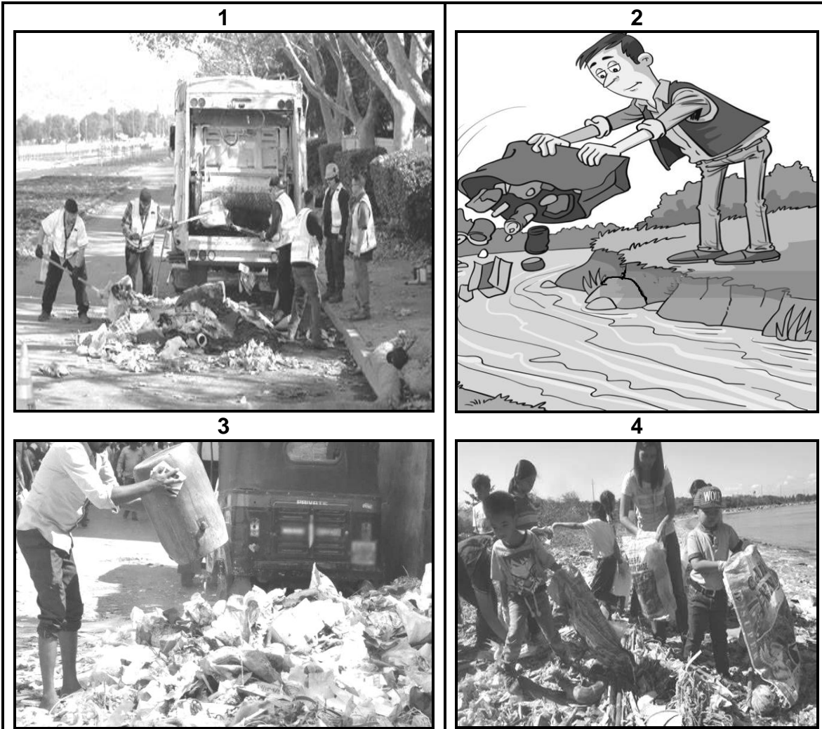
[Zicashunwe ku- www.illegal dumping pics.com ]