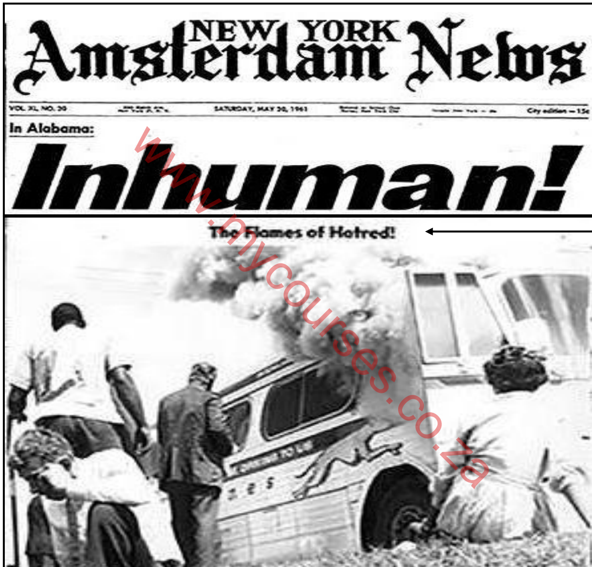
[From NEW YORK Amsterdam News , 20 May 1961]

The newspaper article below was published in the NEW YORK Amsterdam News on 20 May 1961. It used a photograph to effectively report on the challenges that Freedom Riders encountered in their demonstration against racial segregation in the United States of America.