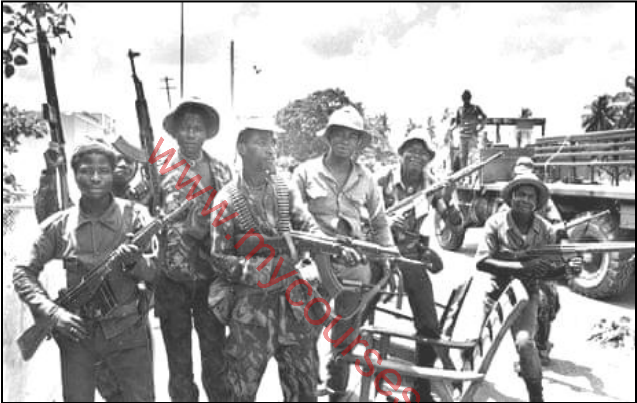
[From the Guardian newspaper, 5 May 2014]

The photograph below, titled 'Angola's Brutal History and the MPLA's Role in it', appeared in the Guardian newspaper, 5 May 2014. It was taken in December 1975 and depicts soldiers of the Popular Movement for the Liberation of Angola (MPLA) who fought in the Angolan Civil War.